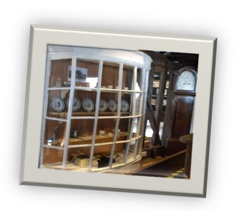
Inside the Museum