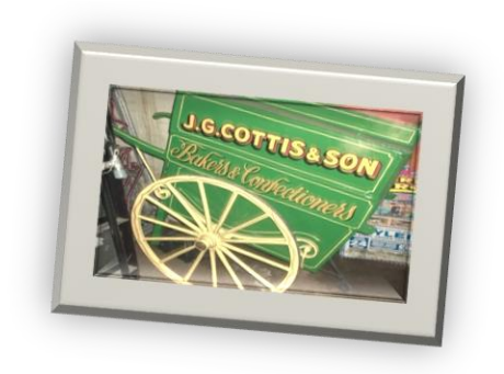
J G Cottis & Son Bakers cart