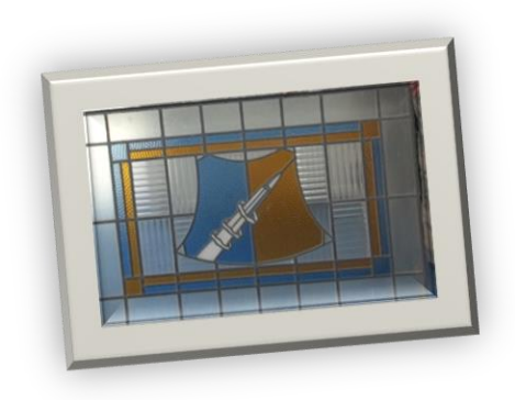
Stained glass window - Rayleigh Rockets